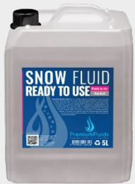
Drums 2,5L – 5L – 10L – 20L 200L -1000L