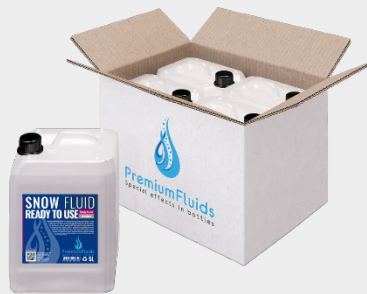
Boxes 6x2,5L – 4x5L