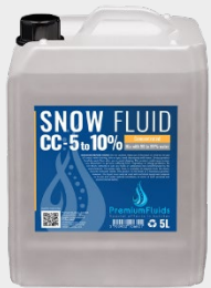
Drums 2,5L – 5L – 10L – 20L 200L -1000L