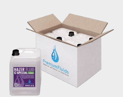
Boxes 6x2,5L – 4x5L