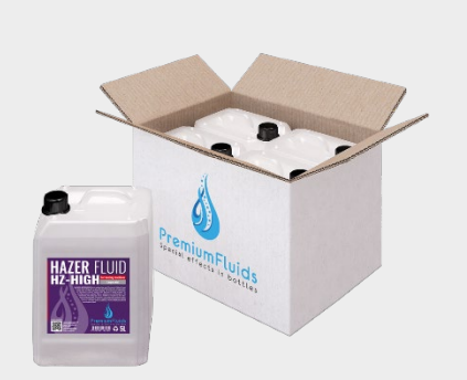
Boxes 6x2,5L - 4x5L