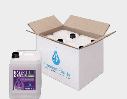
Boxes 6x2,5L – 4x5L