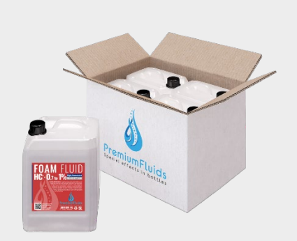
Boxes 6x2,5L – 4x5L