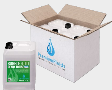
Boxes 6x2,5L – 4x5L