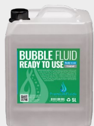
Drums 2,5L – 5L – 10L – 20L 200L -1000L